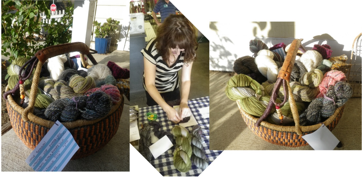
Los Angeles County Fair Entries 2014

Our June program focused on getting ready for the LA County Fair! Members were given a brief tutorial on proper skeining techniques, labeling, etc. Each person entering a skein had to not only estimate yardage and describe their yarn but also give an explanation as to how they intended to use. Although it may not have been expected when spinning, the yarn's intended use is a factor to help judges with their process.